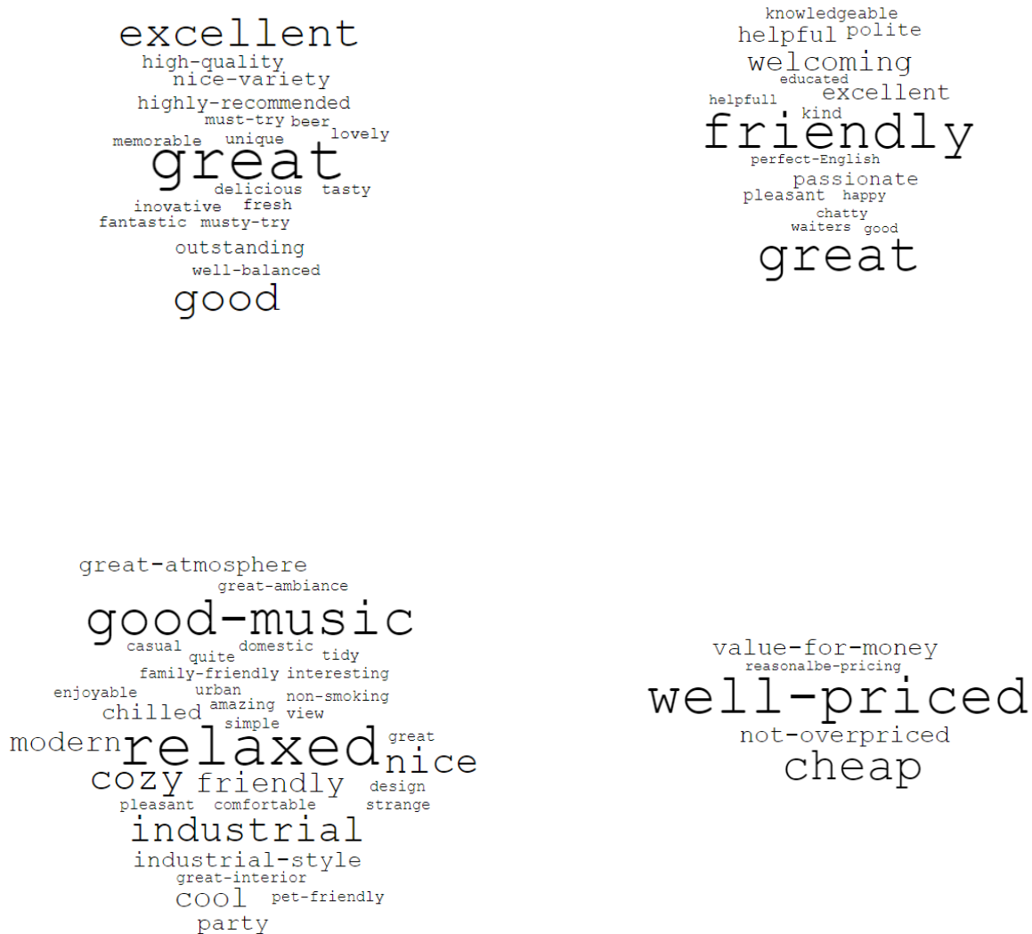
Figure 2. Word clouds for beerscape attributes: (1) beer quality, (2) service staff, (3) atmospherics, and (4) beer value.

In addition to the analysis of the frequency of mentions of particular beerscape attribute, the positive key words relating to the particular attribute, found relevant from the previous research (beer quality, service staff, atmospherics, beer complementary product, beer value), were also extracted from the reviews which were written in more detail. These words were then used to form word clouds shown in Figure 2.